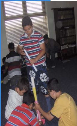
Campers working a team task.

The third week of the day camp went by in the usual fun and fast fashion. The theme of the week was "Planting the seeds for the hereafter". Our focus was the deeds of today that will have an effect on our lives in the hereafter.