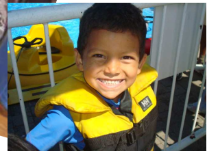
"I like the Merry-go-round in Ontario Place."