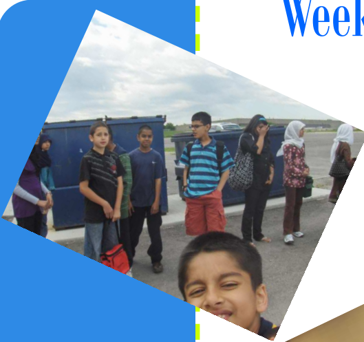
Camper's waiting for the field trip to begin.

All in all, the first week was a roaring success, Alhamdulillah!